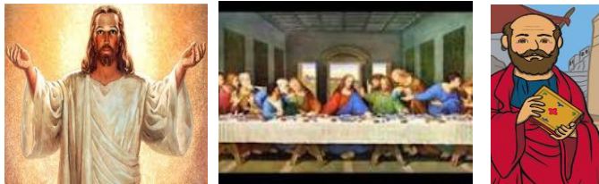
People: Jesus the Messiah and Saint Peter