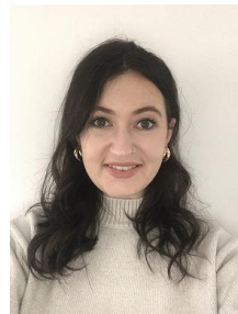
Georgia Volunteer Counsellor