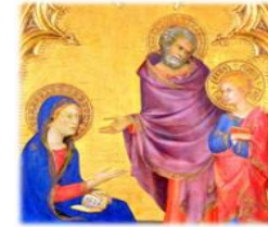
Simone Martini (1342)

We will be using art, film, and drama to help us reflect on the Good News of Jesus.