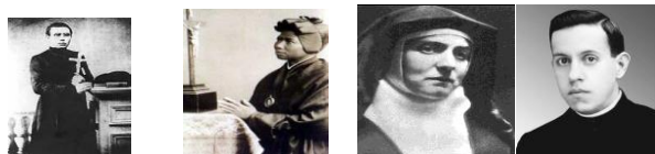
People : Fr Damien de Veuster, St Josephine Bakhita, St Edith Stein, Blessed Miguel Pro